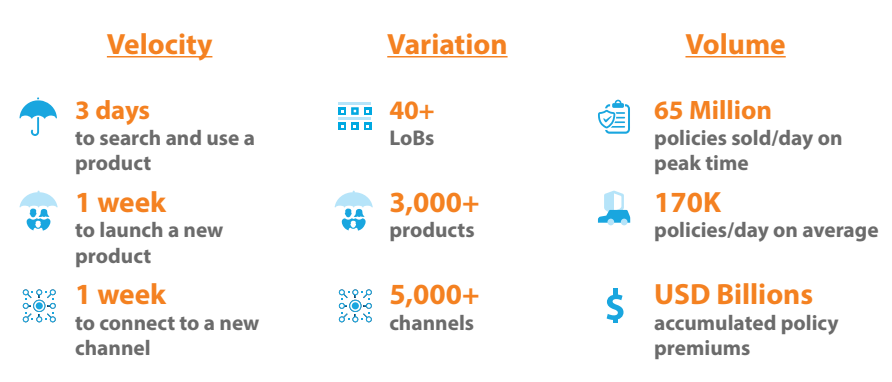
Figure 2. InsureMO Status

InsureMO as an Insurance industry middleware on cloud, is powering the eBaoCloud offerings as well as numerous other applications. Above are the business data about InsureMO.